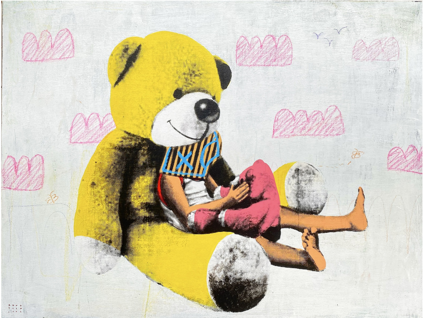
KaraTula Where my heart belongs to, 2024 Mixed Media on Canvas (Serigraph) 30h x 40w in 76.20h x 101.60w cm ₱ 30,000.00