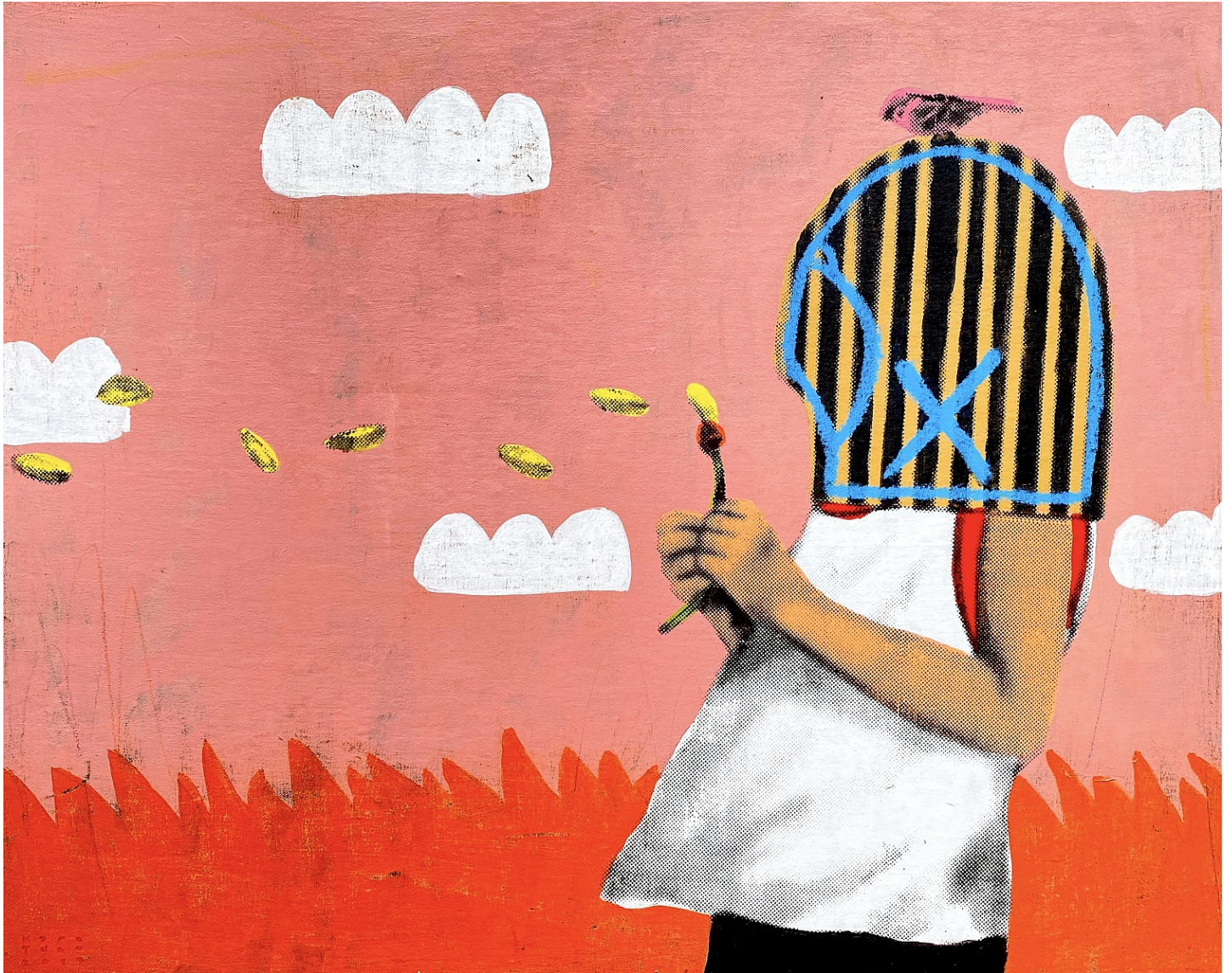
KaraTula Forget me not, 2024 Mixed Media on Canvas (Serigraph) 24h x 30w in 60.96h x 76.20w cm ₱ 24,000.00