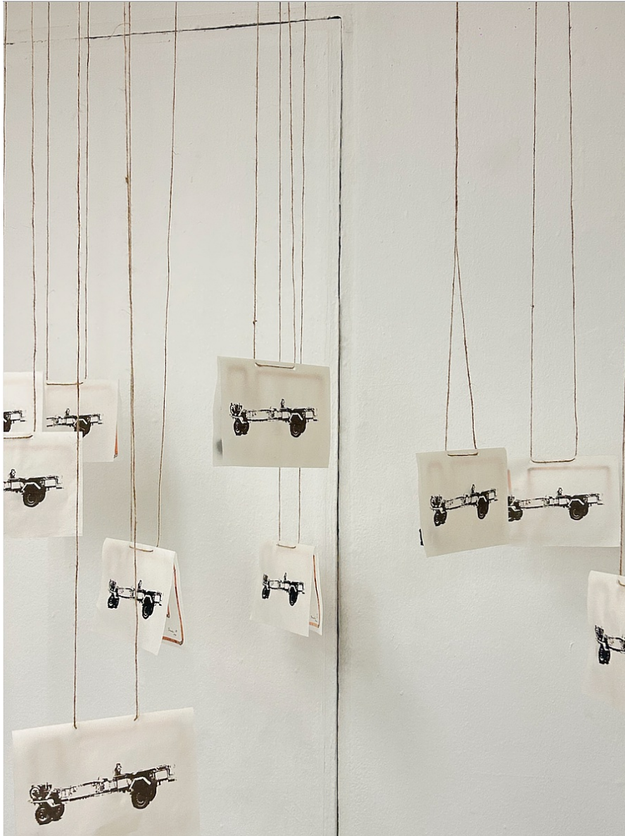
Frankie Lalunio P_Kuliglig_1-17, 2025 Light dependent vibration circuit on parchment paper Variable Edition 1 of 17