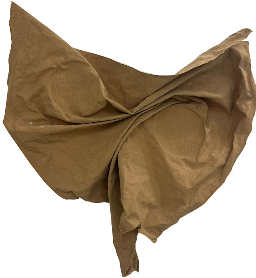
Kiel Rubis All Must Return To...Beige, 2025 Fabric speakers + sound Variable