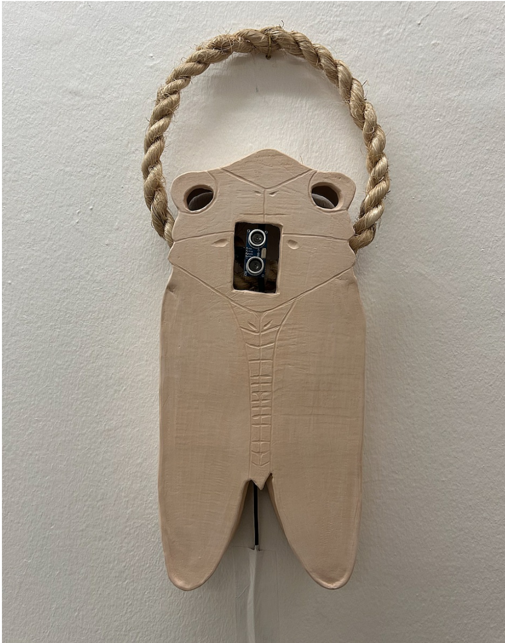
Frankie Lalunio c_Kuliglig_1 , 2025 Arduino Vibrations circuit in stoneware Variable