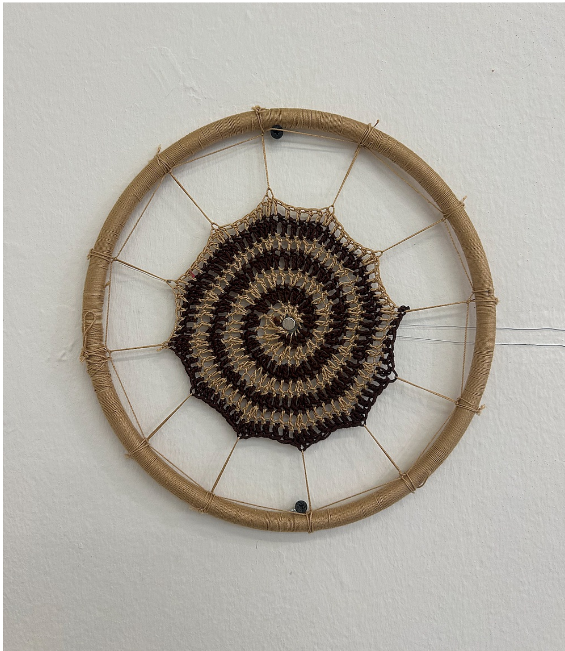
Kiel Rubis Dichromatths, 2025 Circular loom speakers Variable Edition 1 of 4