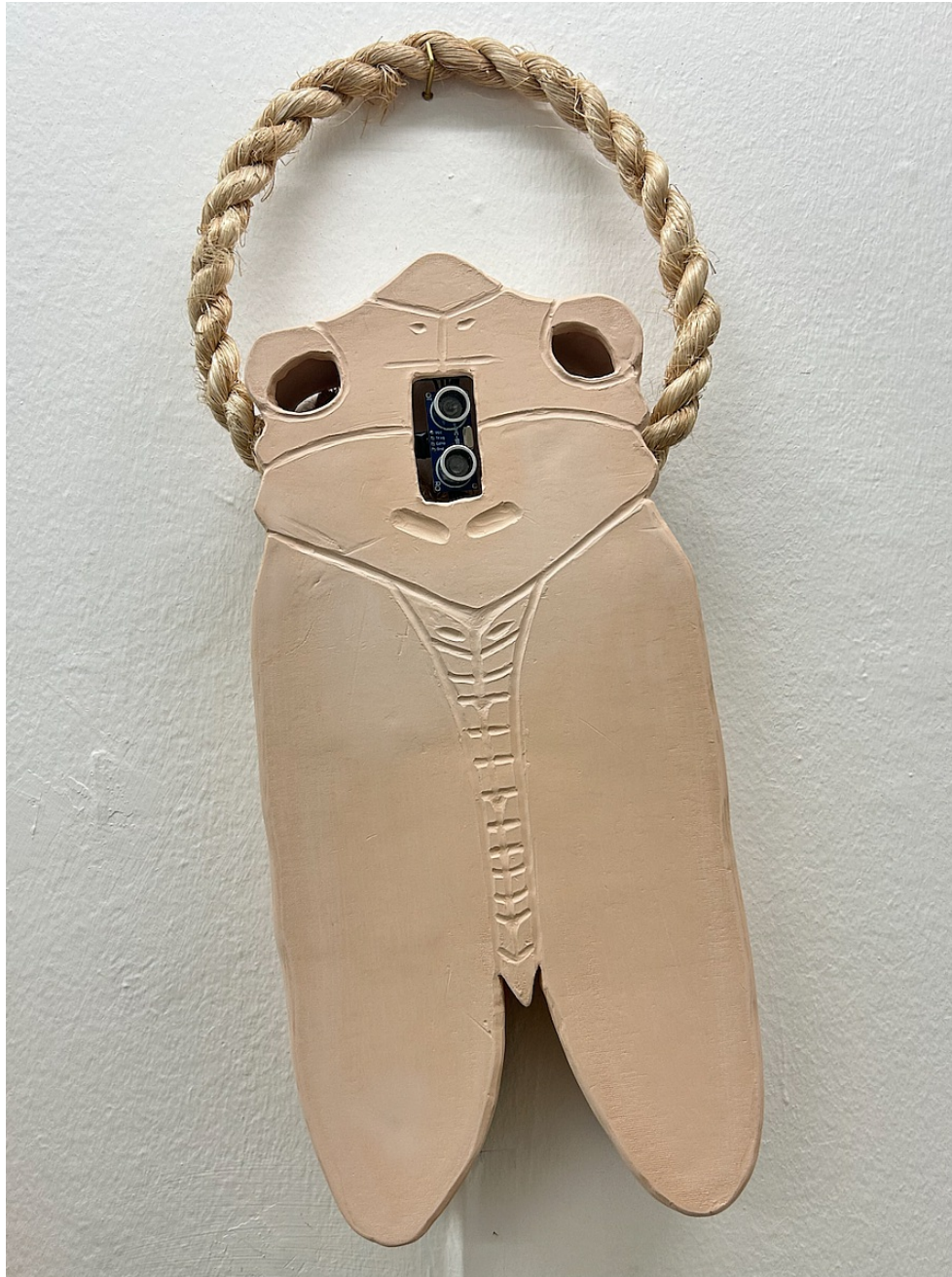
Frankie Lalunio c_Kuliglig_3 , 2025 Arduino Vibrations circuit in stoneware Variable