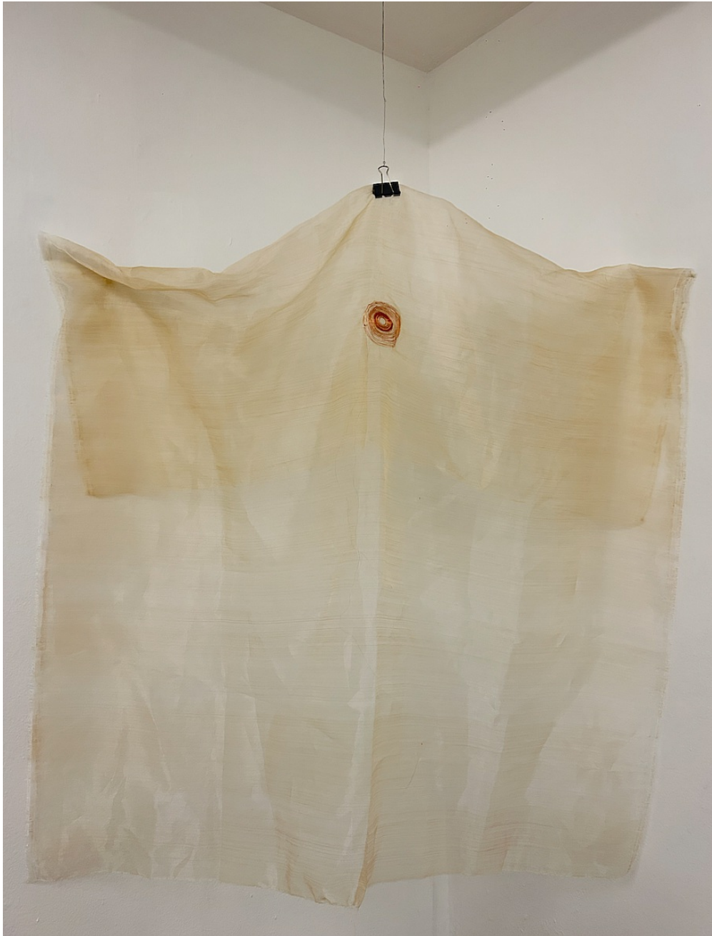
Kiel Rubis Molt , 2025

pina fiber, magnet wire and magnet kinetic acoustic sculpture Variable