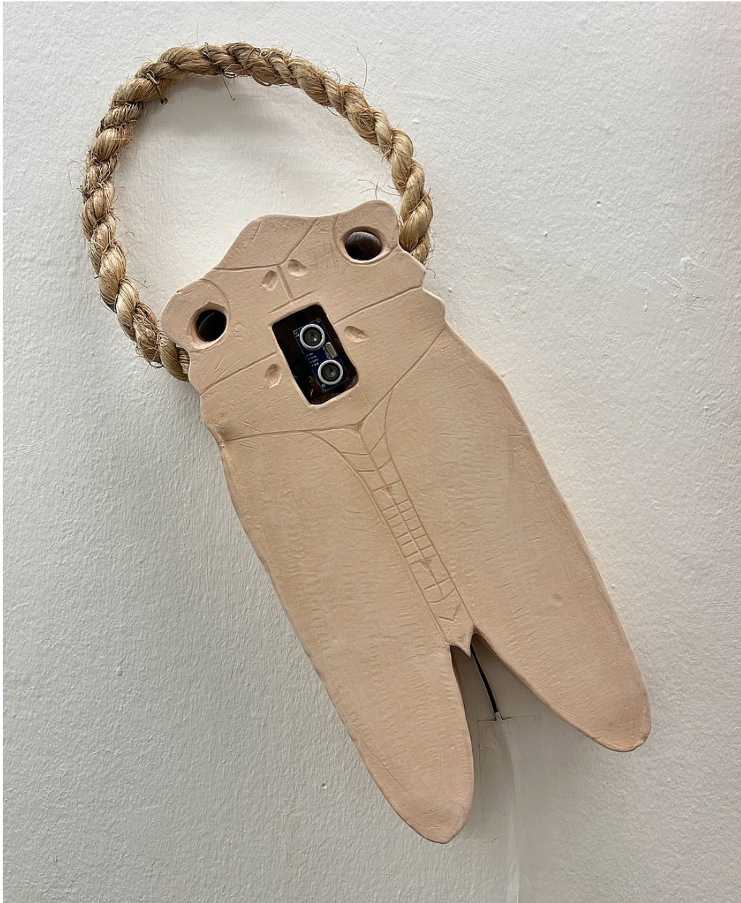
Frankie Lalunio c_Kuliglig_2 , 2025 Arduino Vibrations circuit in stoneware Variable