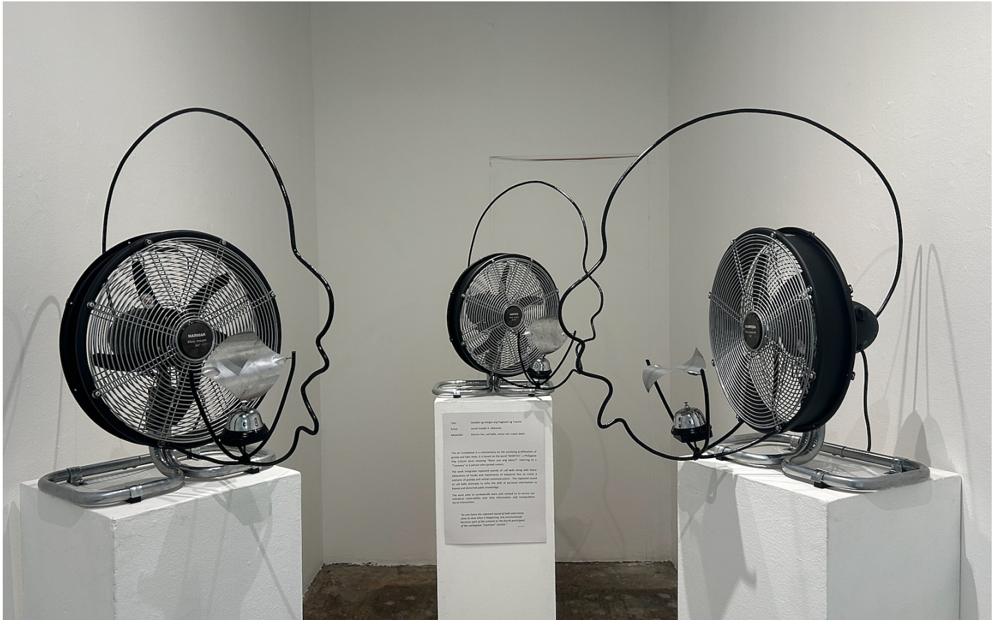
Jamel Obnamia LISTENING TERMINAL 2 (Simbilis ng hangin ang pagkalat ng tsismis) , 2023 Electric fan, flat metal sheet Variable